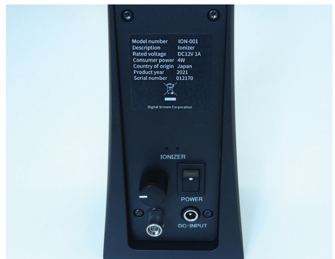
The DS Audio ION-001 from behind, showing the ioniser indicator lights, power switch and brightness control, ground post and socket for the plug-top supply.

the delayed thuds that echo the opening pizzicato phrases are more distinct and more precisely located, both in time and space. On the one hand, ▶▶